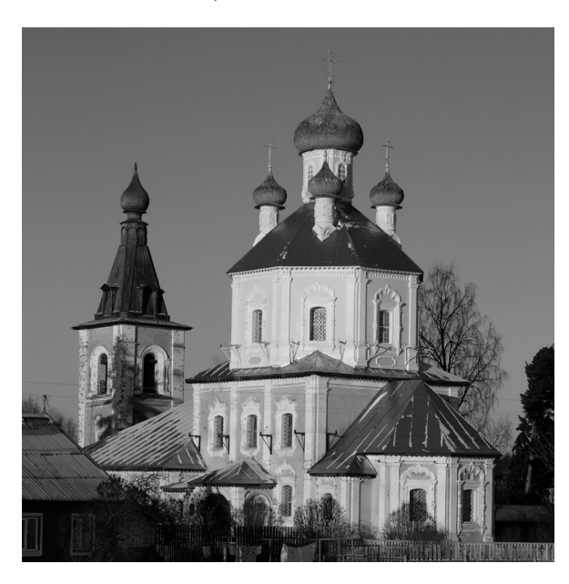
The Church of the Transfiguration, Rogozha, 1756–1770