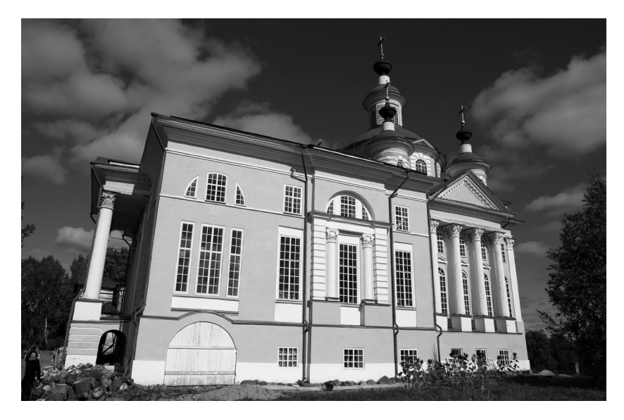
The Church of the Ascension, Saviour-Sumorin Monastery, 1796–1801 and 1825 Photo: Lev Maciel, 2015.

Overall, the church of the Troitse-Scanov Convent is a graphic example of provincial architecture trying to keep up with the metropolitan fashion.